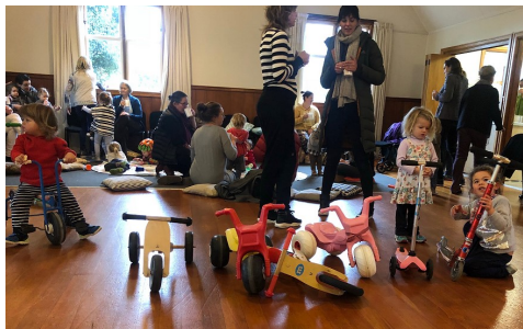
Wheels day at pre-school music

We are realising that we may need to set up a waiting list but, with the narrow window of opportunity for contact, we have been unwilling at this point to discourage any who come.