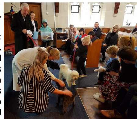
The Pet Blessing Service held in October 2017