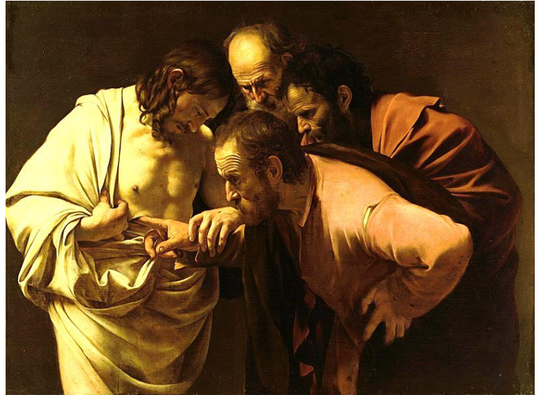
The Incredulity of Saint Thomas by Caravaggio, c. 1602

A very warm welcome to you all, whether this is your first time or thousandth time in church. You are welcome whatever your age, gender, marital status, disability, poverty or wealth, race or sexuality. You are welcome whether you have a deep and mature faith in Christ; are uncertain and still seeking; or have no faith. If you are new to church, please do not hesitate to ask one of those on duty if you have any questions.