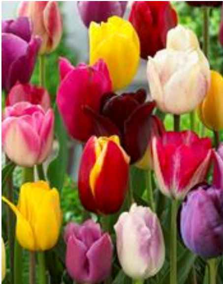
Tulips - Mixed