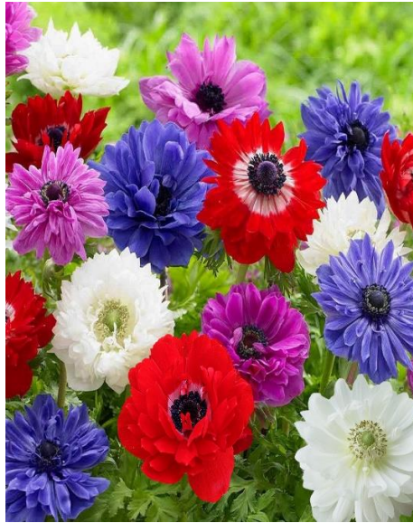
Anemone St Brigid (Doubles)