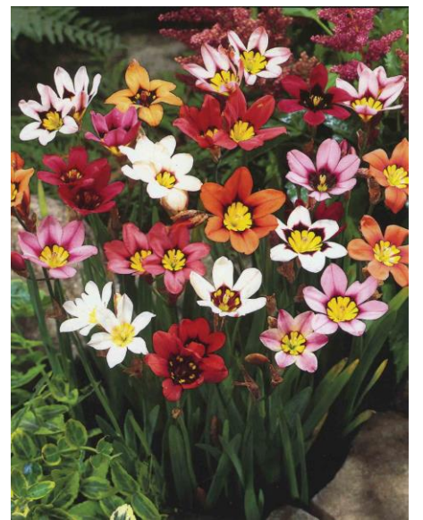
Sparaxis – Harlequin Mix