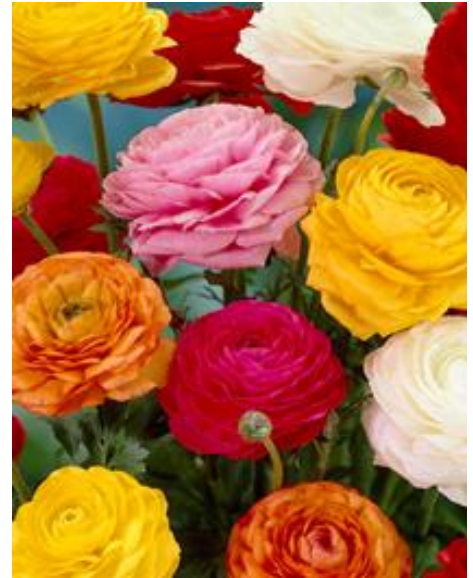
Ranunculus – Rainbow Mix