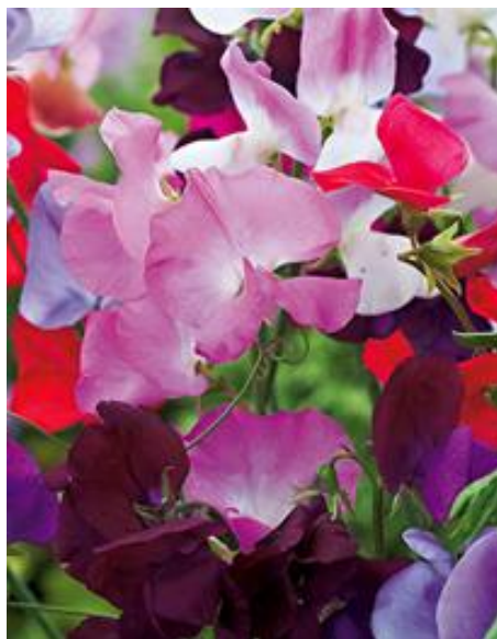
Sweet Pea – Early Multiflora