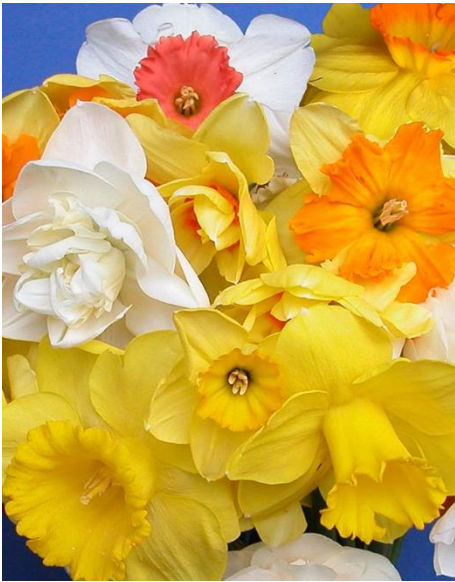
Daffodils – Springtime Mix