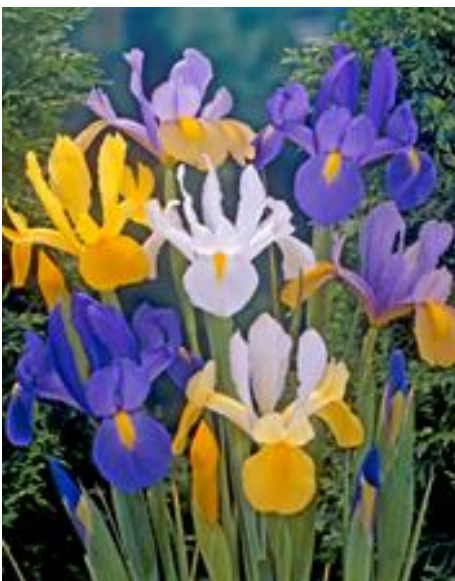
Dutch Iris – Super Mix