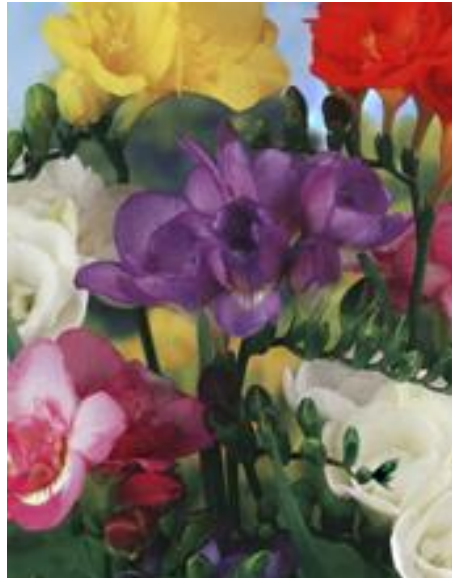
Freesias - Mix