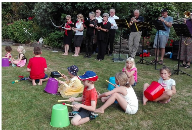
Above: Photos from the Nativity Service

And later the same day saw the Cashmere community Carols being held just across the road. What a fabulous occasion! And a big "Thank You" to the wonderful band and choir, and the enthusiastic participation of children on bucket drums! A gorgeous warm evening and lovely sense of community!